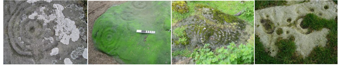
Mixture of crustose and foliose lichens affecting a cup-and-ring motif

Grass and turf (and heather) embed their roots in the rock. Trees can form a canopy that traps air and moisture, creating a damp environment and concentrating atmospheric pollutants. This in turn encourages growth of certain biological organisms such as algae. Tree roots can be very damaging causing rocks, expanding fissure and breaking apart the rock. Tree and shrub cover also produce detritus - leaf litter, pine needles and other decaying vegetation can alter the chemical environment of the rock surface and also trap moisture, both contributing to the dissolution of the calcite matrix.