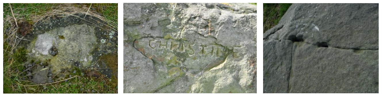
Sheep droppings pooling in a cupmark

Rock art also risks being damaged by other human actions, such as fires or land management activities. Ploughing can cause significant damage to low-lying or part-buried panels, and we can sometimes see plough marks on the panel. Other farm machinery, such as rotating chain flail cutters used to create fire breaks and harvest heather, may also result in serious damage. Activities such as controlled burning, planting, and deforestation may also present a major risk to panels. If the panel is on or close to a route way, then farm vehicles and other human traffic, even mountain bikes, can damage the rock art.