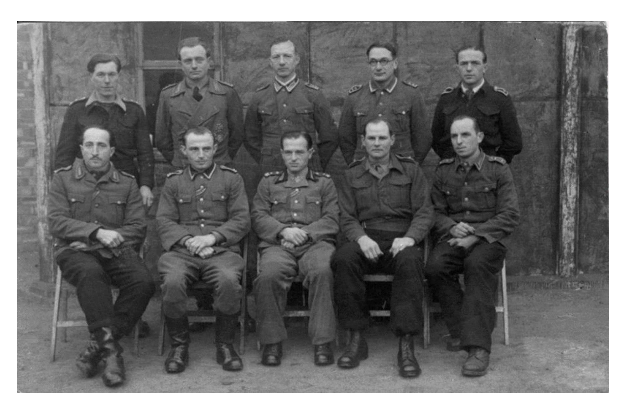
Via <a href="http://www.comrie.org.uk/cultybraggan-pow-photograph/">http://www.comrie.org.uk/cultybraggan-pow-photograph/</a>