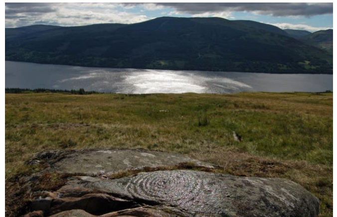
Gallery photograph without scale and N arrow