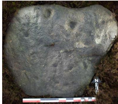
Carved surface photograph