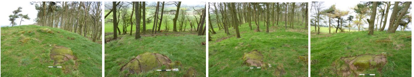
Context shots of the panel to the N, E, S and W

Please include the Panel Name and Number with your record of the image numbers. It is also helpful to add the OS grid reference (OS NGR) as a double check so that we can link the photographs to the recording form, and return to the same panel if necessary.